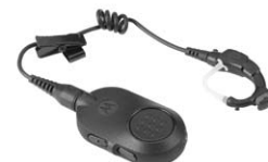
Operations Critical Wireless Earpiece

“When I first saw the MOTOTRBO SL Series I thought that it was a cell phone, not an actual two-way radio. It has all the capabilities of a two-way radio but with a professional, discreet look that fits absolutely well with all our uniforms.”